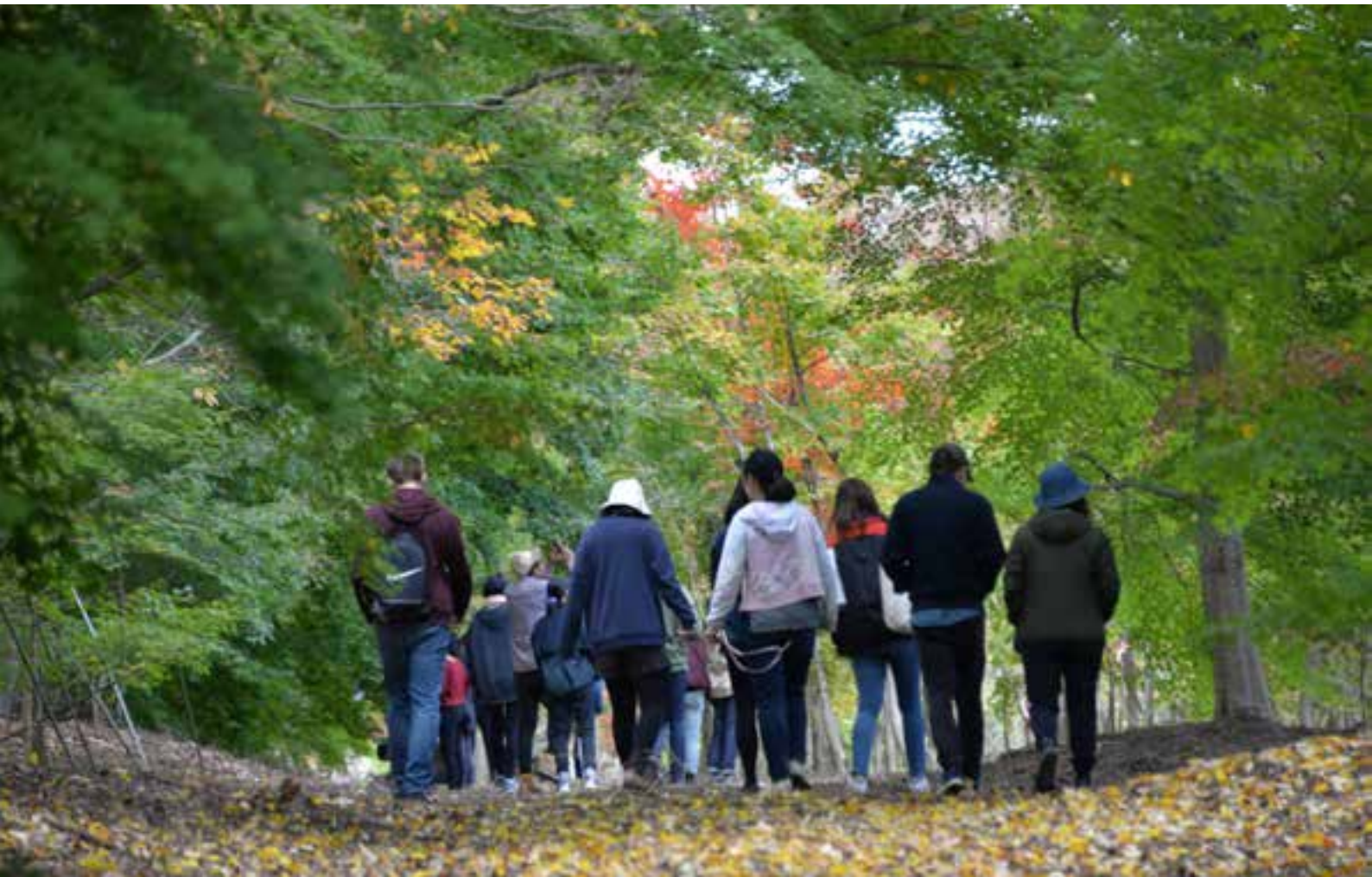
仲田種苗園の「鷹ノ巣公園農場」を見学 Tour "Anosu Park Farm" of Nakada Seeds & Nursery, Ltd.