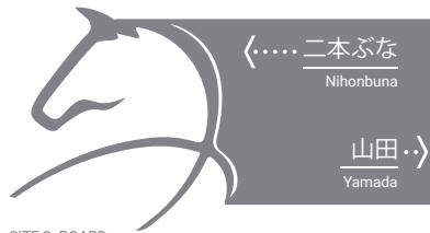
SITE 2. BOARD