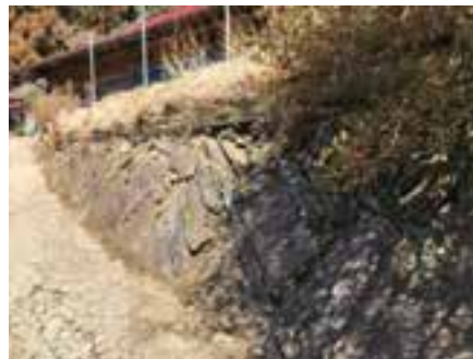
花崗岩露頭に築かれた小屋（稲架（はぜ）置き場） Wood materials on disposal granite stone near by a paddy field