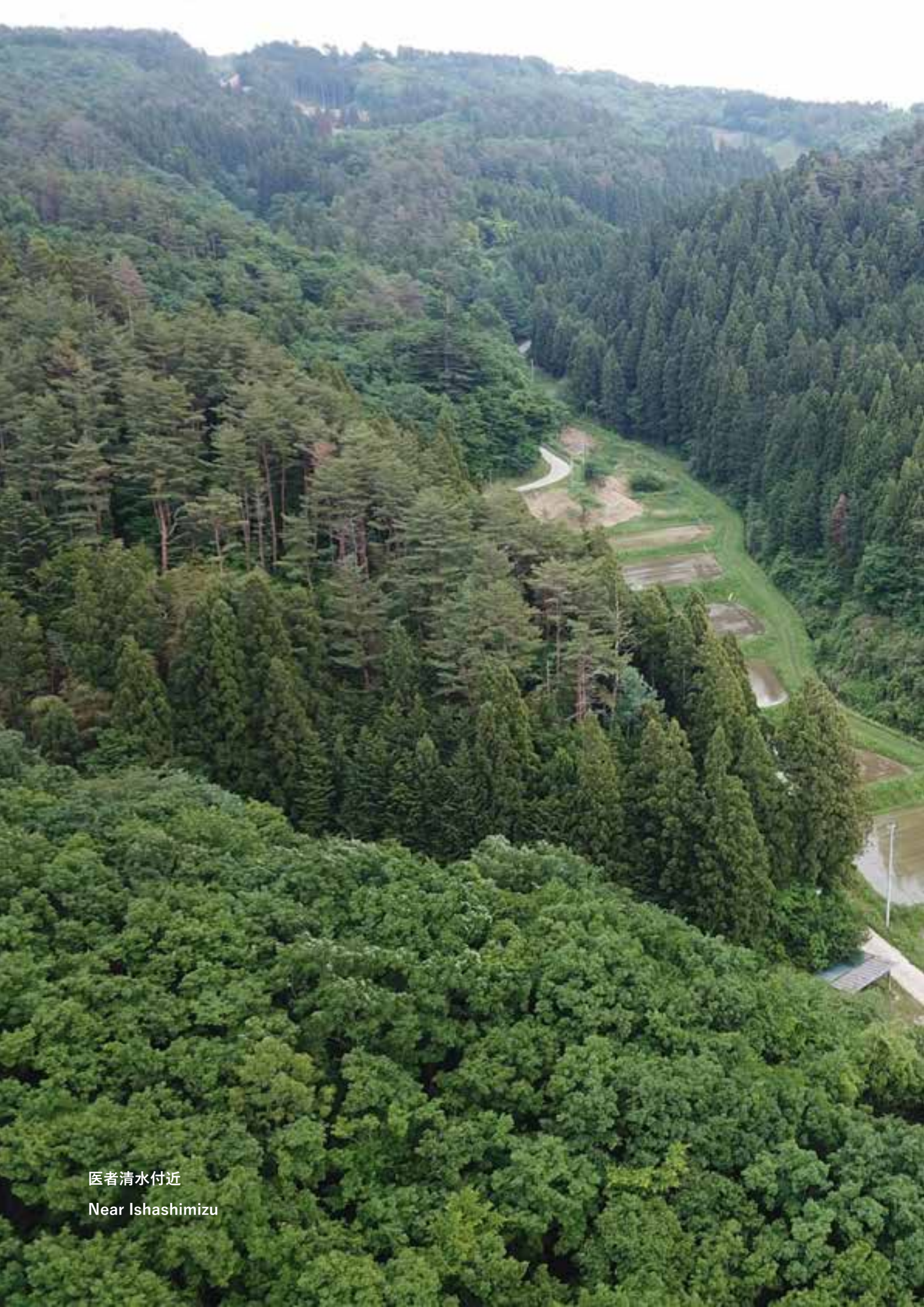
医者清水付近 Near Ishashimizu