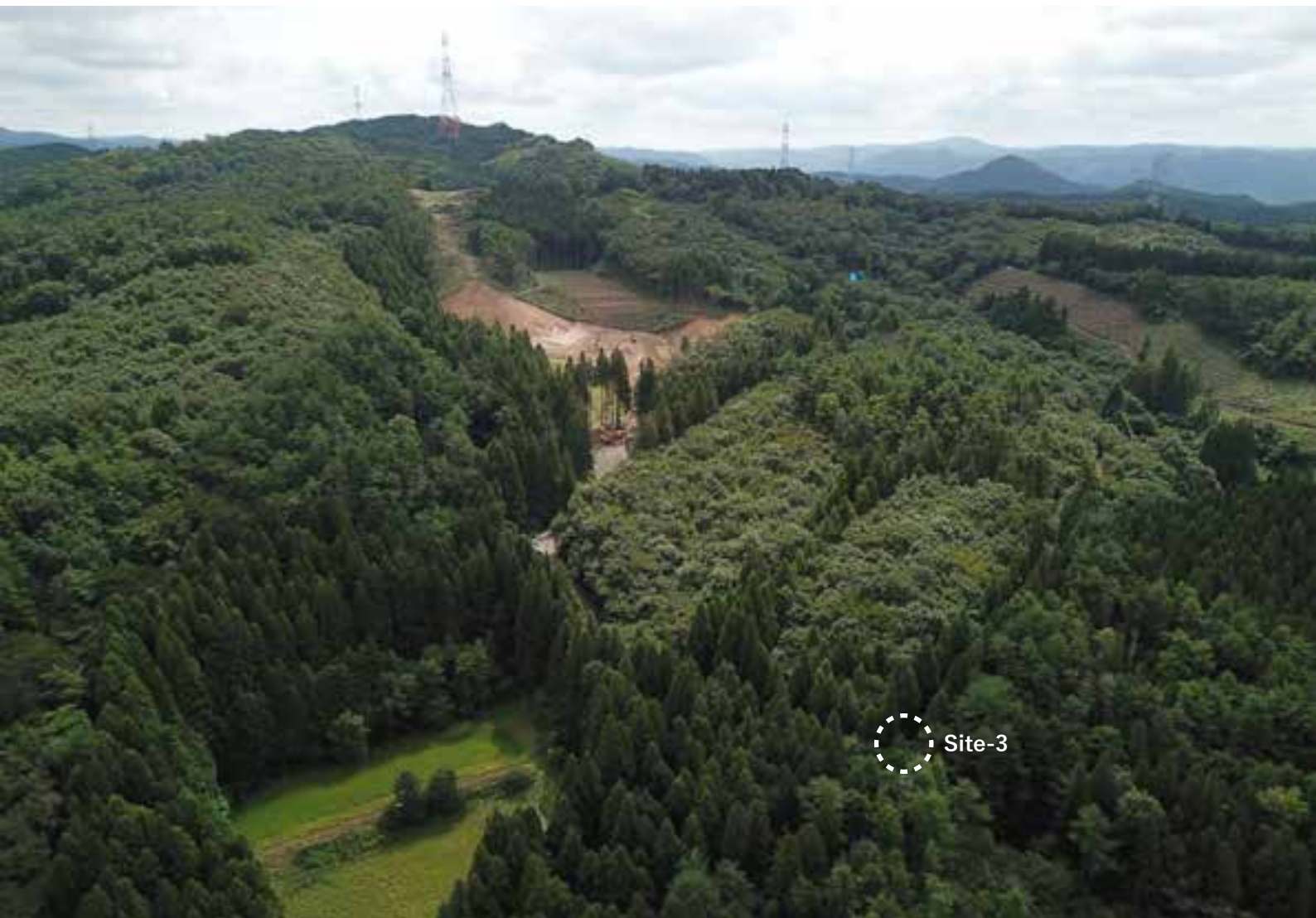
サイト -3 の場所：旧養駒運動場 Site-3: Old Horse Track