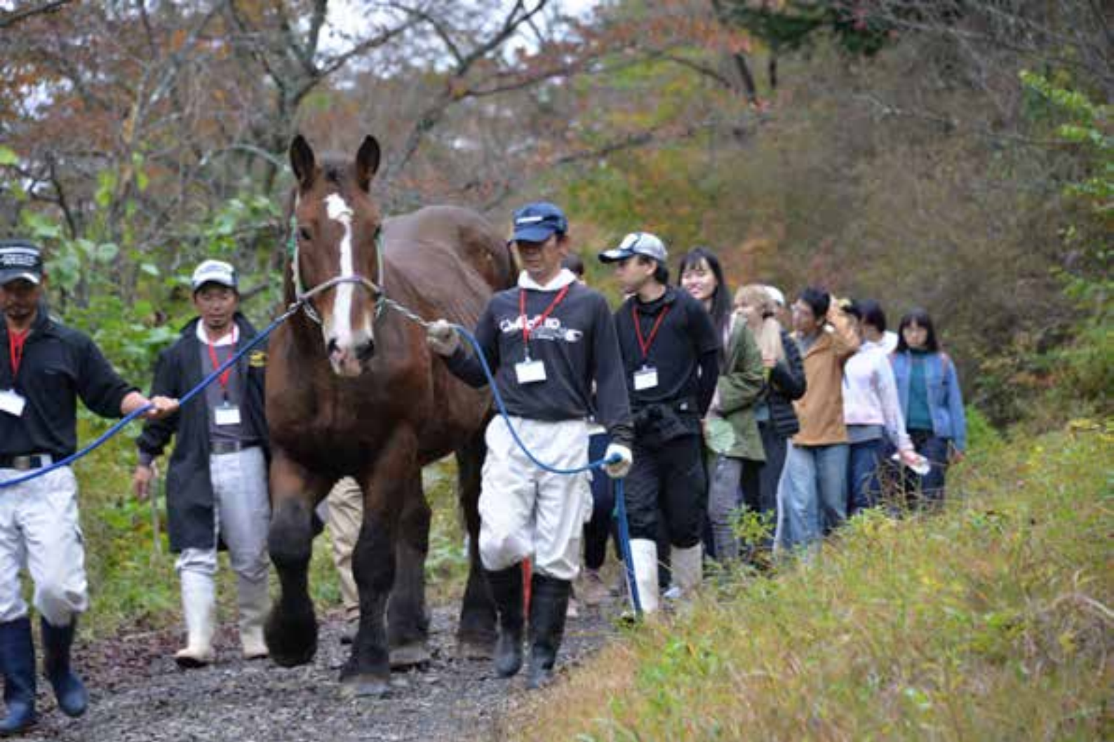
古殿町の NPO 法人馬事振興会の協力を得て、里山園芸民泊から二本ブナまで、人馬ウォークラリーが開催された With the cooperation of NPO Life With Horse of Furudonomachi, from Satoyama gardening private stay to Hihonbuna, walk rally with horse