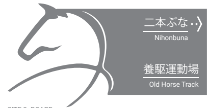
SITE 3. BOARD