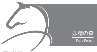
SITE 1. BOARD