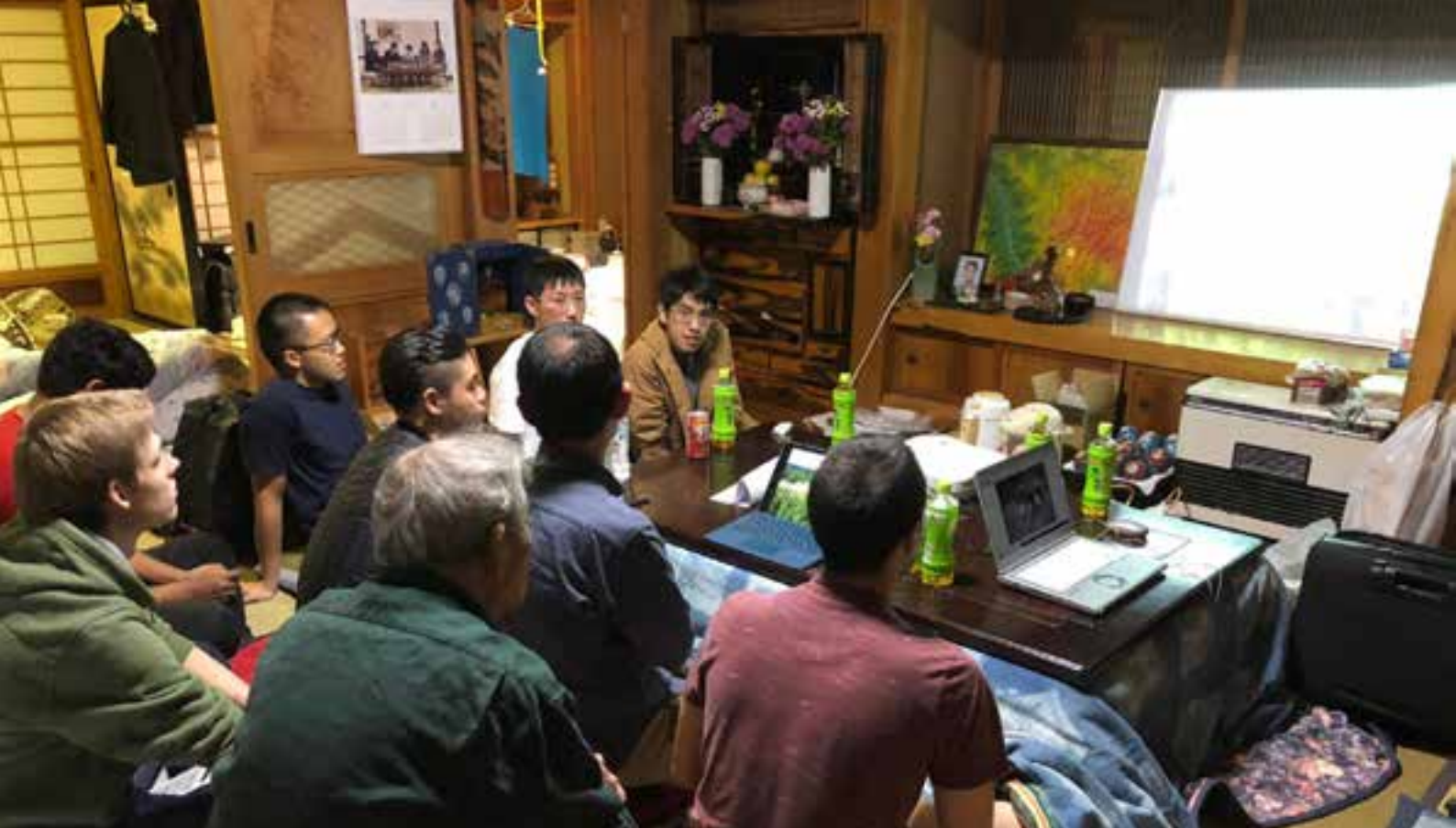
里山園芸民泊では、宿泊の男性グループがドローン写真などでミーティング At Night, a group of males in Satoyama gardening private stay meet with drone photos etc.