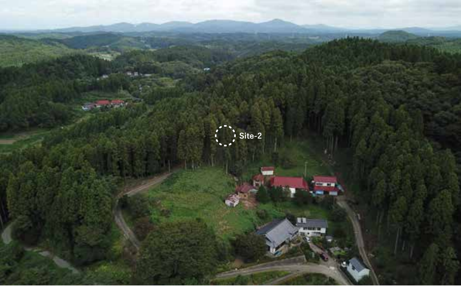
サイト -2 の場所：オールドストリートコーナー Site-2: Old Street Corner