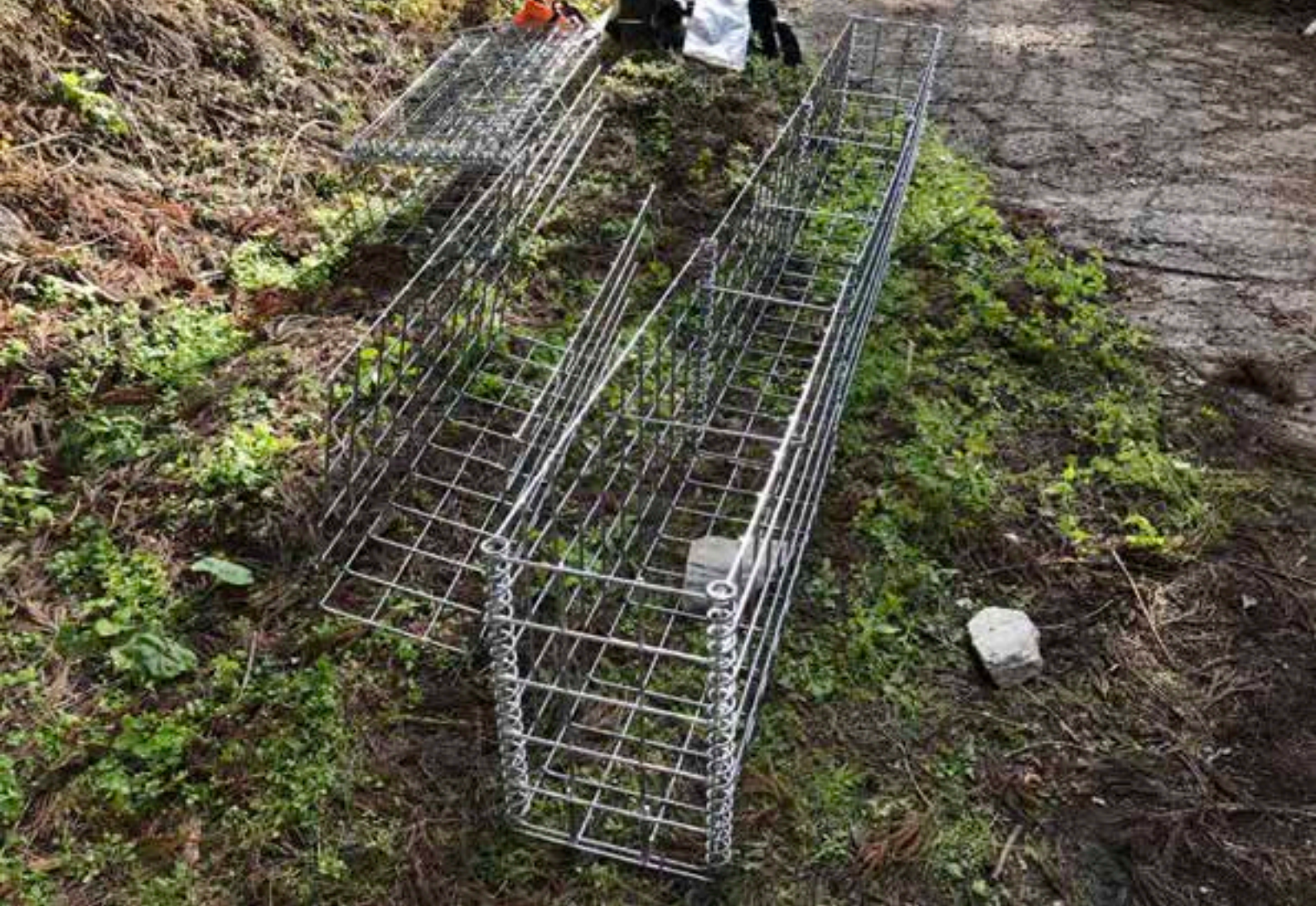
フトンカゴ Gabion Box